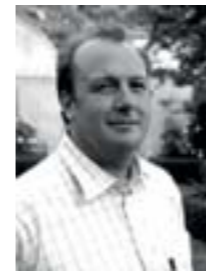
Arne Maynard is a leading garden designer based in London and Monmouthshire